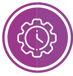
及更多活動 ... and more ...

為加強學生職業技能，新特蘭大學推出「Sunderland Futures」計劃為學生提供多方面的創新職業訓練及支援，透過這些活動，學生更有機會為自己拓展行業人脈網絡，並培植領導才能。