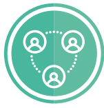
交流機會 Exchange Opportunities