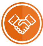
企業探訪 Corporate Visits