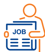
職業拓展日 Career Days