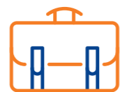
及更多活動 And more...

為加強學生就業能力，新特蘭大學為學生提供創新的就業訓練及支援，學生可透過多方面的資訊及活動，拓展行業人脈網絡，培植領導才能。