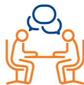
企業探訪 Corporate Visits