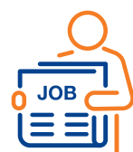
職業拓展日 Career Days